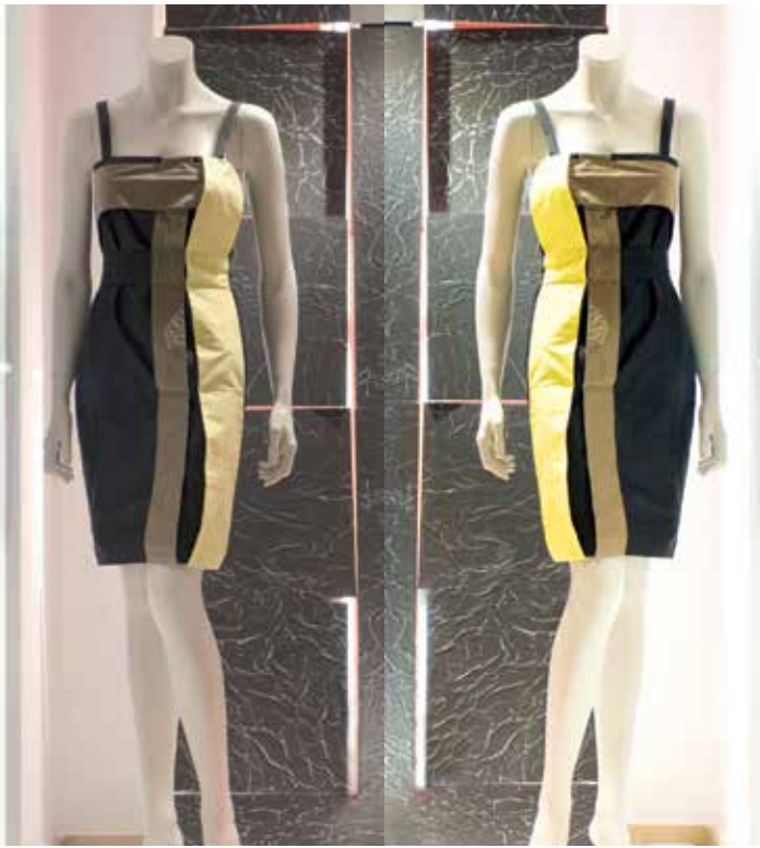
Shop window with the standard clear glass